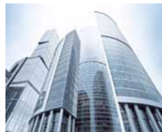
11. It's a s _ _ _ _ .