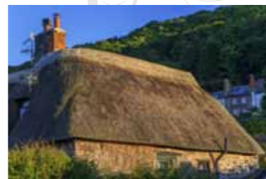
9. The roof of this t _ _ _ _ house is covered with s _ _ _ _ .