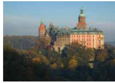
2. It's an old c _ _ _ _ .