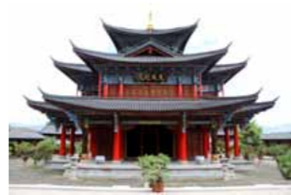
3. It's a Chinese p _ _ _ _ .