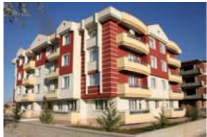
1. It's a b _ _ _ _ of f _ _ _ _ .

Buildings. Fill in the gaps under the pictures.