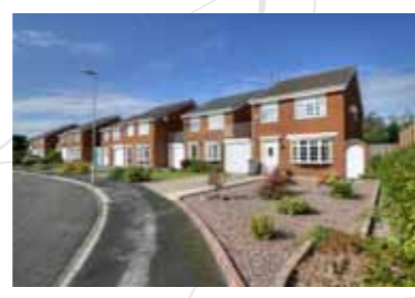
12. These are t _ _ _ _ houses.