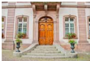
7. It's a r _ _ _ _ .