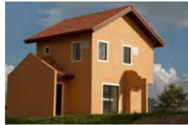
5. It's a d _ _ _ _ house.