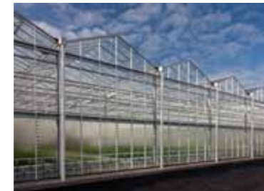
8. It's a g _ _ _ _ .