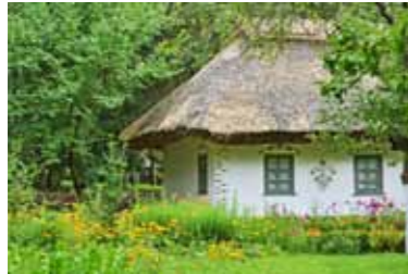
4. It's a country c _ _ _ _ .