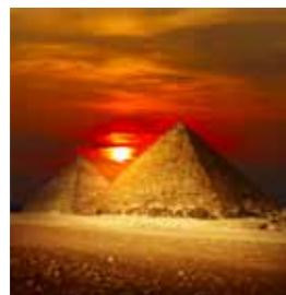
10. These are p _ _ _ _ .