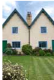
6. It's a s _ _ _ - d _ _ _ house.